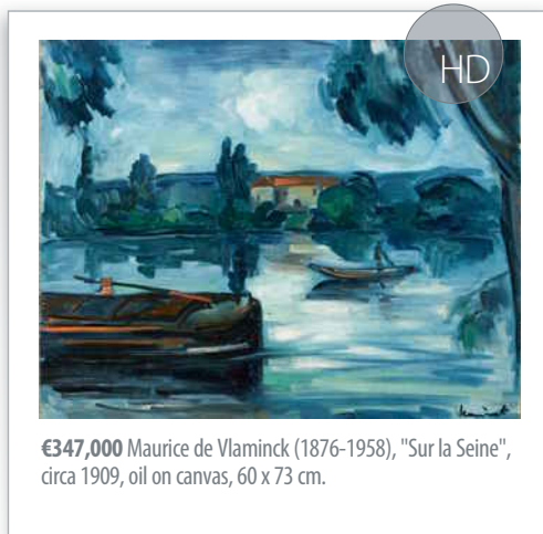
€347,000 Maurice de Vlaminck (1876-1958), "Sur la Seine", circa 1909, oil on canvas, 60 x 73 cm.

The sale of paintings from the collection of film director René Clément (1913-1996) was a real success. After decorating his apartment in Monaco, the thirteen paintings went on to treble their estimates by totalling €2,342,000. Presented as the showpiece of this collection, this "Portrait de Madeleine Grey à la rose", estimated at €250,000, certainly whetted the appetites of collectors. During his second visit to Egypt, Kees van Dongen met Madeleine Grey (1896-1979), the brilliant French soprano, in a cabaret hall in Alexandria. After a keen battle between seven prospective buyers of different nationalities, the auction came down to a fierce duel between two bidders in the room. The vibrant soprano was finally taken into the arms of a Parisian collector, to the sound of applause from the room. A Cézanne-style landscape by Maurice de Vlaminck was the second star of the sale. Having moved to Rueil-Malmaison in 1905, the painter would often depict views of the banks of the Seine, as with this painting from circa 1909. The composition, evincing a rigour