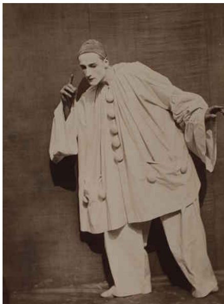
Félix Nadar (1820-1910) - Adrien Tournachon (1825-1903), "Pierrot écoutant (le mime Jean-Charles Deburau 1854-1855", period print on albumen paper, 36 x 27.2 cm.

After regaling Parisian audiences with its melodramas, the Boulevard du Temple turned into the Boulevard du Crime during the French Restoration. Frédéric Lemaître adopted Robert Macaire's rags and tatters, while Baptiste Deburau dressed up as Pierrot, making a great success of sensational numbers at the Funambules. (He was magnificently portrayed by Jean Louis Barrault in the film "Les Enfants du Paradis".) On the death of Baptiste Deburau in 1846, his son Charles took over the inspired character of Pedrolino from the Commedia dell'Arte, donning the silhouette of the pitiful dreamy lover suffering in silence with equal brilliance. In 1855, the photographer Nadar and his younger brother Adrien asked Charles Deburau to pose for a series of character head shots, the idea being to promote their photographic studio at the Universal Exposition. They were so successful that the prints were awarded a gold medal.